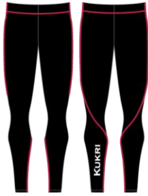
Kukri Branded Legging