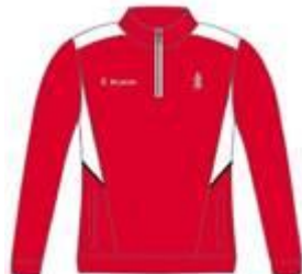
¼ Zip Top